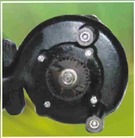
● Bottom View of Chrome Steel Cutter